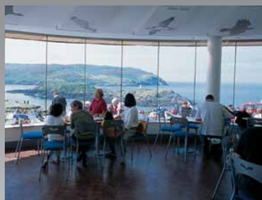
The Sound Café

The tour returns to Douglas via the site of the Island's original Parliament at Tynwald Hill St Johns where there will be an opportunity to take photos.