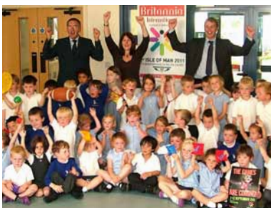
Schools "Adopt a Nation"