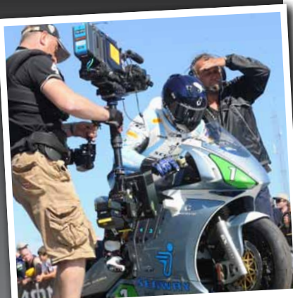
Quality Television Coverage

The Isle of Man has a world class group of journalists, broadcasters, photographers and cameramen who report and follow the many world class sporting events that the Isle of Man hosts and participates in, including Rally's, Trials, Walks, Athletics, cycling and the TT Races and Manx Grand Prix Festival bikes races.