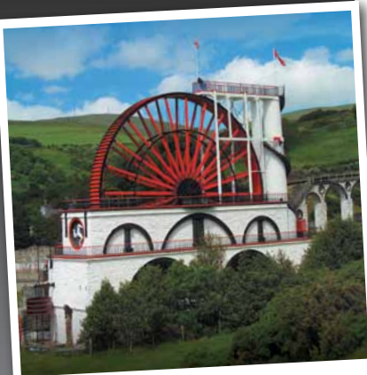
The Great Laxey Wheel