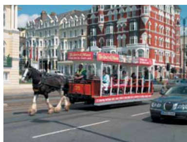
Douglas horse-drawn tram