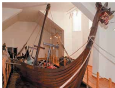
The House of Manannan