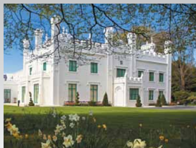
Milntown House & Gardens