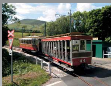
Manx Electric Railway