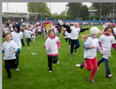
The Manx Youth Games

Everyone on the Isle of Man is very excited about this prestigious event and is gearing itself up to provide the people of the Commonwealth with a really warm Manx welcome.