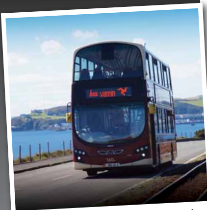
Free and regular transport links

The intention is to give Douglas a real buzz during the Games so, in support of the daytime activities, there will be what the organisers are billing as an "urban variety show" in the evening of Saturday 10th at the Gaiety Theatre, showcasing a cross section of some of the festival's most inspirational and creative young performers.