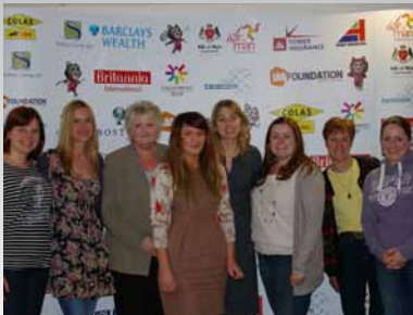
The Volunteer Committee