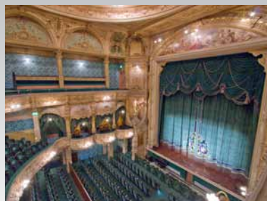
The Beautiful Gaiety Theatre