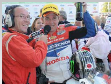
Live commentary will be available