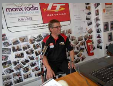
Manx Radio's worldwide service