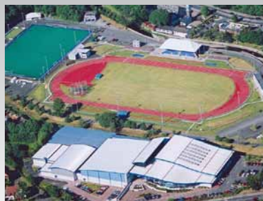
The National Sports Centre