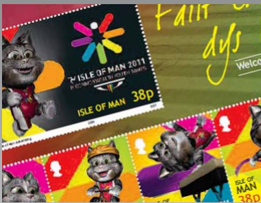
The First Day Cover